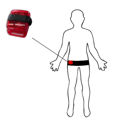
Figure 1: Shows the accelerometer (the Actigraph wGT3X-BT) and how it was instructed to be worn.

Young children (n=279, aged between 9 and 36 months) were recruited through the universal healthy child pathway (i.e. health visitors) and specialist children's health services (e.g. neonatology, community paediatrics, paediatric physiotherapy) in thirteen areas in England, UK. Children recruited through specialist services (42%, n=118/278) were purposefully oversampled to ensure coverage of children with a range of development trajectories. Table 1 shows the key characteristics of the sample; further details are available elsewhere(14).