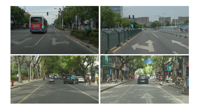
Fig. 6: Traffic cone detection results without freespace constraint. False positives are shown in rectangles.

experiment. Our data augmentation method is efficient to generate effective training images. We draw that one can use considerably few augmented instances on background images to obtain comparable detection performance.