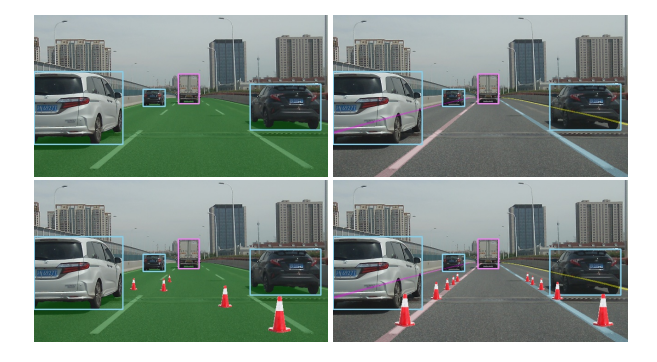
Fig. 3: Traffic scene context aware superimposition of instance masks. First row: Freespace and traffic lanes with common objects computed by a multi-task deep model to obtain the traffic scene understanding. Second row: Depthaware scaling of instance masks with traffic context constraints.