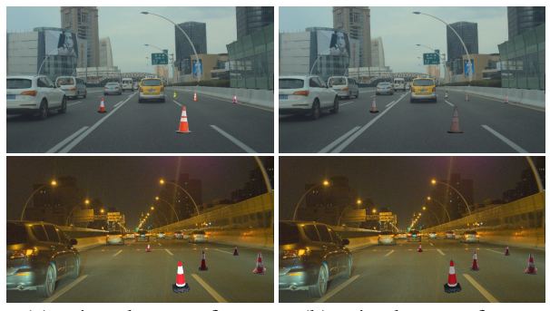
(a) w/o color transform (b) w/ color transform

We can then scale an instance mask accordingly and paste it with traffic scene context constraints. Fig. 3 shows some results of Copy-Paste data augmentation with depth-aware scaling.