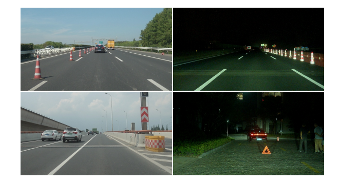
Fig. 1: Sample images of rare objects (traffic cones, traffic barrels and traffic warning triangles) in autonomous driving.

in rare object detection using these detectors is the lack of large annotated datasets. For example, finding a large labeled dataset similar to common object categories (e.g., vehicle, pedestrians) is unlikely since rare objects are extremely less frequently present in the traffic scene.