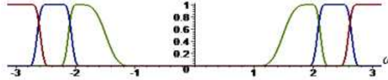
Figure 2: Plots of moduli of frequency functions H^{10}(\omega) (red), H^{11}(\omega) (blue) and H^{12}(\omega) (green).