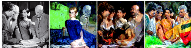
Figure 7: Subversive explorations of photomontage: we start with a photograph of Minette de Silva shown meeting with Pablo Picasso, Jo Davidson and Mulk Raj Anand in 1948 (public domain), modified by CLIP-CLOP with prompts “A painting by Paul Delvaux”, “A painting by Caravaggio”, and “A painting of a group of Sri-Lankans”.