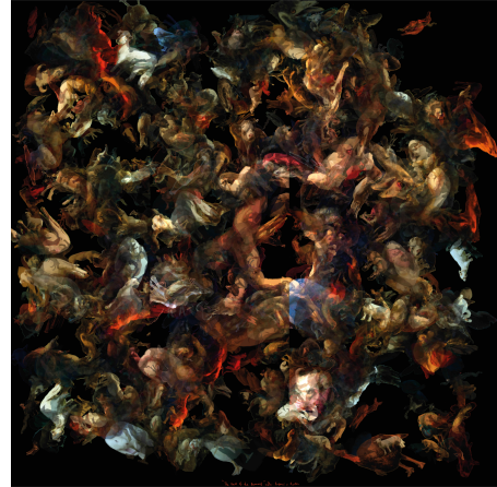
Figure 1: The Fall of the Damned after Peter Paul Rubens and Scott Eaton (2021). High-resolution collage of image patches of animals, optimized hierarchically with 3x3 overlapping CLIP critic evaluations.

The Collage Generator optimizes such transformations guided by a dual text-and-image encoder (Liu, Gong, and others 2021), like the popular CLIP model from OpenAI (Radford, Wook Kim, and others 2021), pre-trained on large datasets of captioned images collected on the internet (hence incorporating various cultural biases). Intuitively, the dual encoder computes a score for the match between a textual