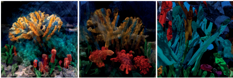
Figure 3: Influence of rendering methods on style. Left to right: transparency, masked transparency and opacity

Achieving High Resolution CLIP-CLOP’s advantage is that it can produce collages at any resolution. During optimization, we use down-sampled patches, as CLIP is restricted to 224 \times 224 images; for the final rendering, the same spatial transformations are applied to the original high resolution patches.