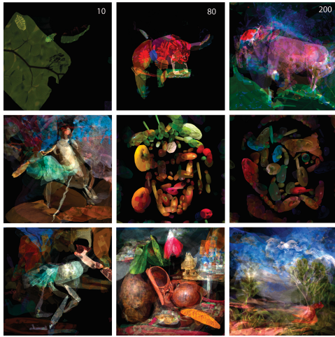
Figure 6: Collages made of different numbers of tree leaves patches (bulls in the top row), as well as Degas-inspired ballet dancers made from animals, faces made of fruit and still life or landscape made from patches of animals.