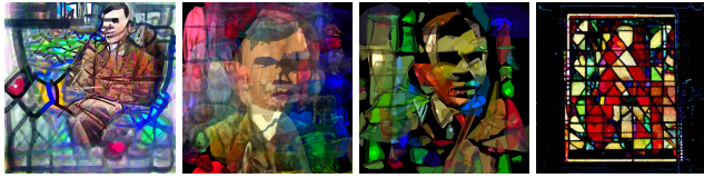
Figure 5: “Alan Turing in stained glass”. Left to right: CLIPDraw with 1000 strokes, CLIP-CLOP with 100 animal patches or 200 broken plate patches, guided diffusion.

the top row) that fewer patches make more abstract Picasso-inspired collages of a bull, while more patches make more realistic images.