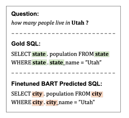
Figure 1: Finetuned BART's OOD generalization errors due to overfitting the spurious biases.