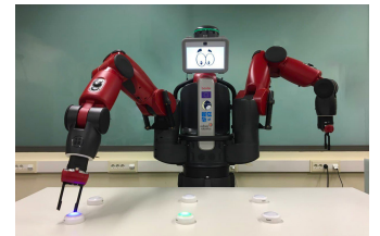
Figure 1: The experimental setup: buttons “light up” when pressed if all their preconditions are satisfied.

In both experiments we use the right arm of the robot and we control its wrist final position (x, y, z) through Cartesian position control. Regarding perception, we used the images from an RGB-D camera located on the ceiling of the room and