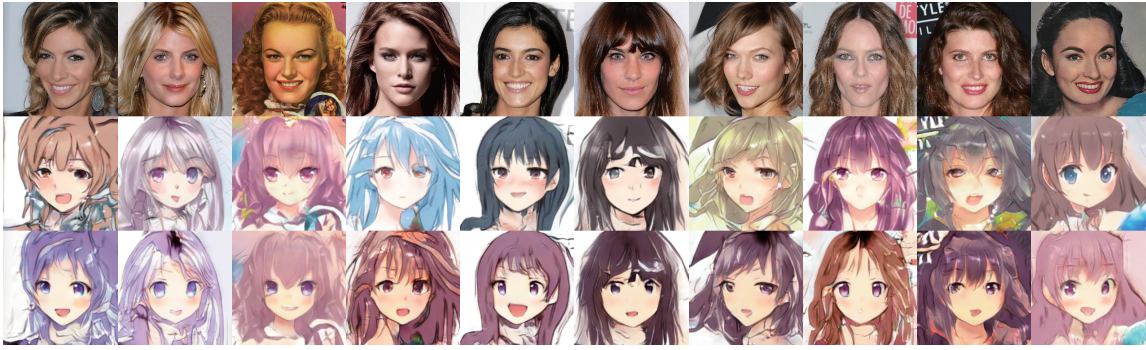
Figure 2: Stylization results on face2anime dataset. Top: source image. Middle: styles generated by baseline UGATIT model with 57.1 GMACs. Bottom: our searched model under 5.56 GMACs.