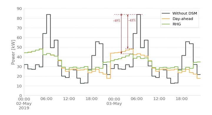
Fig. 2. Aggregate Load comparison for New York over 2 days for a set of 10 active prosumers and 5 passive consumers. Price rates \rho_1 , \rho_2 are doubled from 6:00 to 10:00 and 18:00 to 22:00 to incentivize peak shaving.