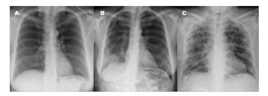
Figure 1: Example CXR images from COVIDx CXR-3 benchmark dataset: (A) normal or no pneumonia or SARS-CoV-2 finding, (B) pneumonia infection, and (C) SARS-CoV-2 positive finding.

Table 1: Distribution of CXR images and patient cases (in parentheses) for both training and evaluation datasets in COVIDx CXR-3, split by infection type. Note the total for patients is 10 less than the sum across the training set as some patients had both SARS-CoV-2 negative and positive CXR images from different studies.