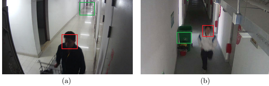
Fig. 1. Examples of the SIs with low image quality, which are from the SI quality database (SIQD) [2]. The red rectangle region is the blurred face and the green rectangle region is the clear background.

in quality due to the artifacts introduced to the SI acquisition and transmission process [2,3,4,5], such as poor lighting conditions, low compression bit rates, etc. The SIs with low quality may lead to the poor performance of the computer vision tasks and thus make the IVSS difficult to effectively analyze the content of surveillance videos [6,7]. Hence, it is necessary to develop an effective quality assessment tool for SIs, which can help the IVSS to filter the low-quality SIs and improve the performance of the IVSS.