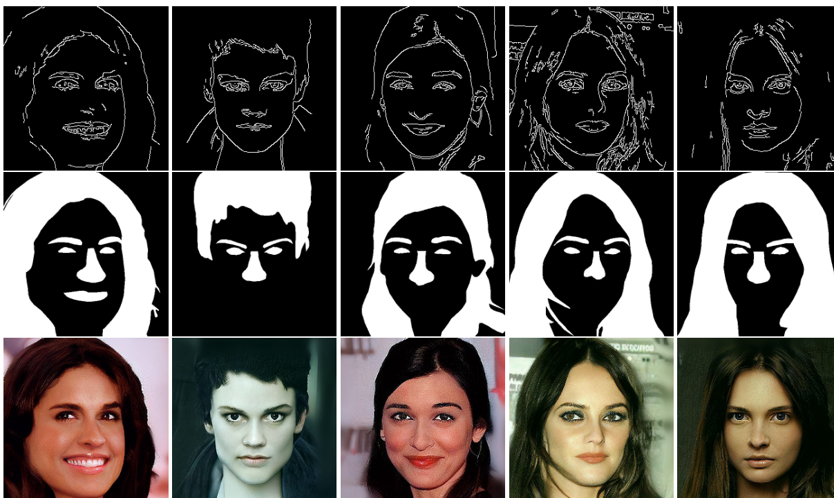
Figure 4: Image samples generated with three modalities sketch, segment and text. The text prompt used in all these results are "This person has black hair" .