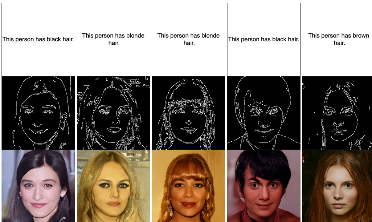
Figure 3: Results using the modalities sketch and text.