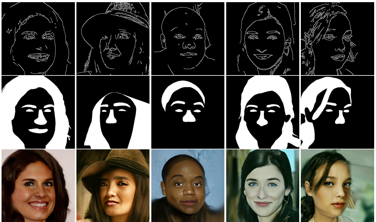
Figure 1: Results using the modalities sketch and partial face mask.