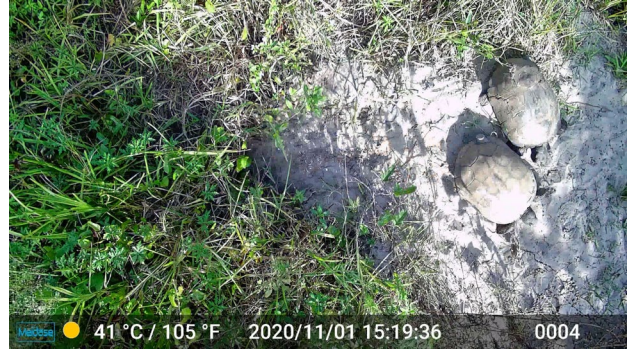
Figure 2: Example of the overhead images taken at a burrow entrance. The overhead view facilitates identifying individual tortoises using their carapace shape and coloration.

Video Compression: For long-term storage, each day’s time-lapse images are compressed into one MP4 video file per camera. Compression is performed using ffmpeg, a popular open-source video processing tool (ffmpeg.org). In addition to creating individual video files for each camera day, a composite video is created for each burrow day showing a time-aligned side-by-side view of the burrow’s overhead and frontal cameras.