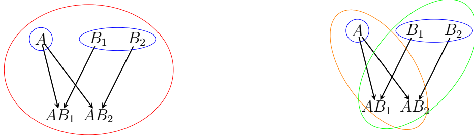
Figure 1: The left and right panels correspond to the grouping structures in examples 1 and 2, respectively.

from the selection rule dictionary, we seek all groups that satisfy the condition. We next give two examples of grouping structures with the LOGL.