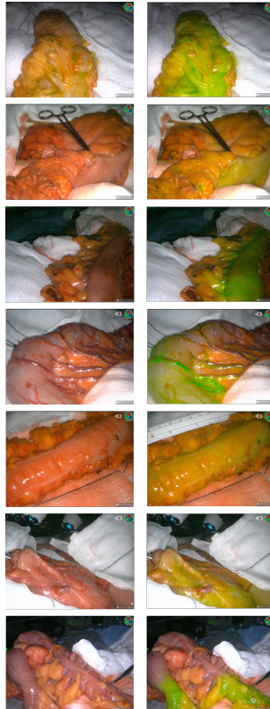
Fig. 1: Representative frames of the training set

Training took 21 minutes and 11 seconds. The validation on data not used in the training set was done manually using the Gradio app. The performance metrics can be seen in Table 2.