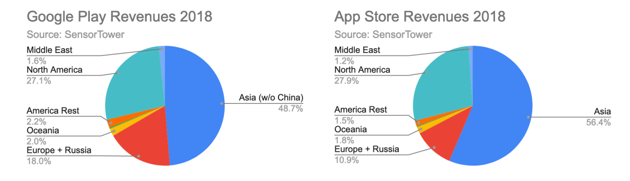
Figure 3. App revenues by country in 2018. Source: SensorTower<sup>6</sup>

If the GDPR has affected apps' viability 'substantially' (and 'induced the exit of about a third of available apps'), then one would expect that the EU is among the most important drivers for revenues and for app downloads. Neither is true.