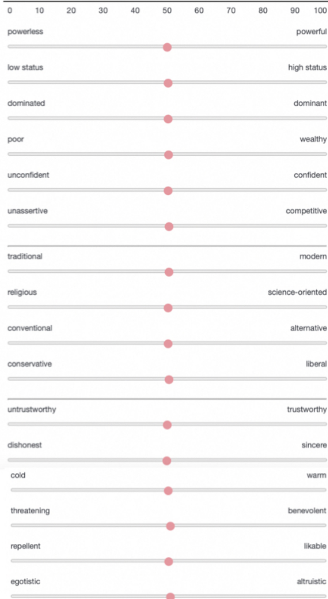
Figure A2: Example of the survey for one group.

As viewed by American society, (while my own opinions may differ), how [e.g., powerless, dominant, poor] versus [e.g., powerful, dominated, wealthy] are Christian people ?