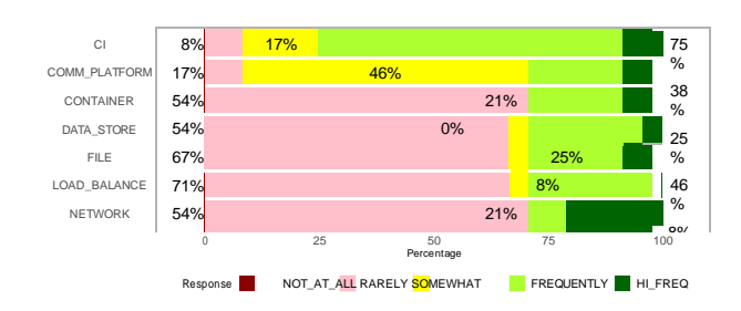
Fig. 4: Answer to RQ<sub>4</sub>: Practitioner perception of frequency for identified resource categories.