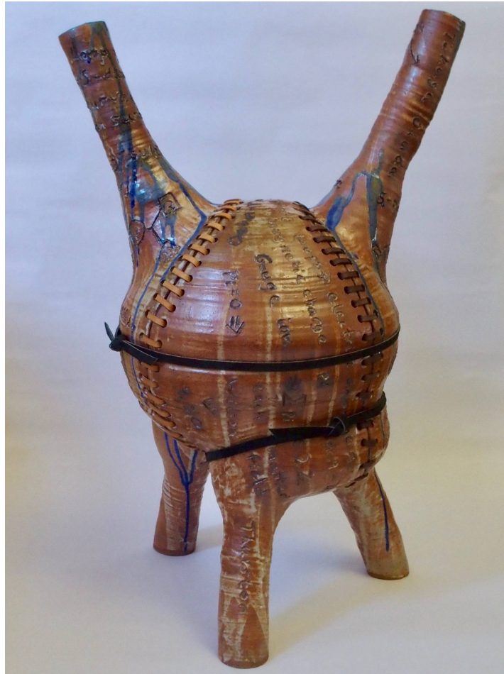
Figure 8: “Sewing-6”. Thrown and assembled stoneware with iron oxide wash, shino and blue glazing and leather straps, 63 × 42 × 35cm. The 5-punctured sphere is assembled from three “pairs of pants”.