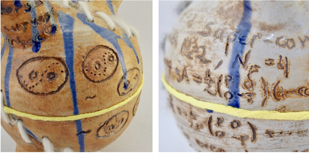
Figure 9: Details from “Sewing-2”: The ovals (left) are two pairs of pants with the dotted lines representing the yellow string. This is required for a proper calculation of the Dehn-Thurston parameters. The physics avatar is also inscribed on the pieces (right). These are values of the gauge and scalar fields corresponding to a line operator with the same quantum numbers as the curve on the surface.

According to Gaiotto's mapping, each cut on the surface corresponds to one copy of Maxwell theory (to be precise an su(2) vector multiplet). These theories may have electrically charged particles (like an electron) and magnetically charged ones (which are not observed in nature, though there are active searches for them).