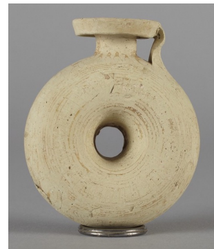
Late Corinthian, 575-550B.C., 7.4 × 6.3 × 3.1cm, Princeton Museum [9].