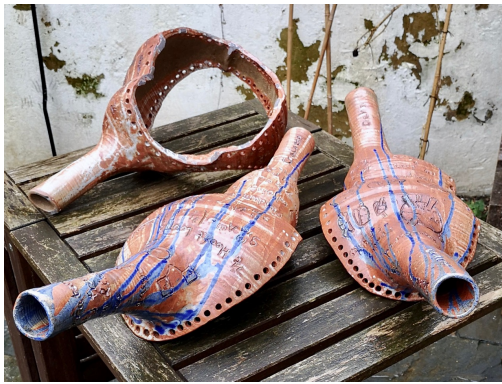
The three pairs of pants after being cut.