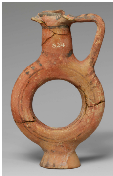
Cypriot, 850-600B.C., h:17.1cm, the Met Museum [6].