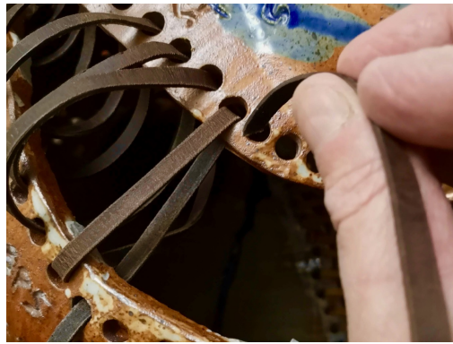
Sewing the pieces together with leather straps.