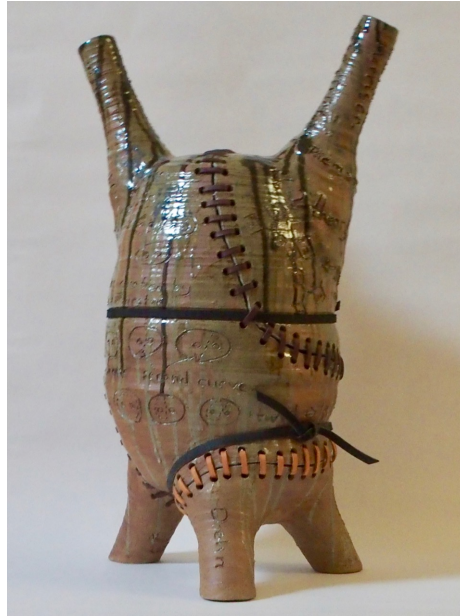
Figure 1: "Sewing-7". Thrown and assembled stoneware with iron oxide wash, partial glazing and leather straps, 63 \times 38 \times 26\text{cm} . The 5-punctured sphere is assembled from three "pairs of pants".

A series of ceramic artworks are presented, inspired by the author's research connecting theoretical physics to the beautiful theory of Riemann surfaces. More specifically the research is related to the classification of curves on the surfaces based on a description of them as built from basic building blocks known as "pairs of pants". The relevant background on this mathematics of these two dimensional spaces is outlined, some of the artistic process is explained: Both the conceptual ideas and their implementation. Many photos of the ceramics are included to illustrate this and the connected physics problem is briefly mentioned.