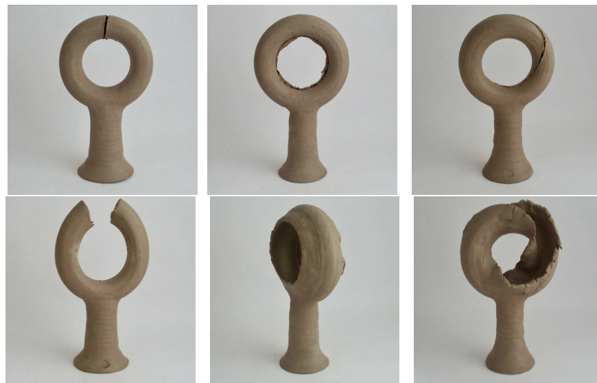
Cut along the short cycle. Cut along the long cycle. Cut winding both cycles.

Figure 3 illustrates the steps I use in making a torus on a modern potter's wheel. See the captions for details. The resulting piece is a torus on a stand where the latter represents a puncture in the torus. There in fact has to be a puncture, as one cannot fire ceramic pieces with trapped air. As mentioned above, such a surface can be viewed as a single pair of pants with two legs sewn together. Conversely, we can cut the punctured torus to get the pair of pants, as I illustrate in Figure 4.