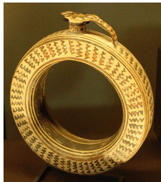
Protocorinthian, 675-650B.C., h:14.7cm, Louvre Museum [5].