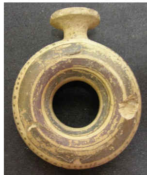
Early Corinthian, 625-600B.C., 8.2 × 6.8 × 1.9cm, Ure Museum [12].