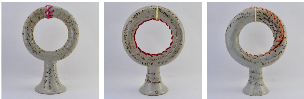
Figure 5: “Sewing-1”, wheel thrown and altered stoneware, incised, iron oxide wash, celadon glaze and yarn. Triptych. Each 27 \times 20 \times 10\text{cm} .

The pieces in Figure 4 are for illustration purposes. For my sculptures, I do cut them, but aim to keep the original shape of the torus. I also pierced holes along the cut before firing the pieces. After the works come out of the kiln, I use yarn or leather straps to “sew” the pairs of pants back into once-punctured tori. The resulting completed pieces form the triptych “Sewing-1”, shown in Figure 5.