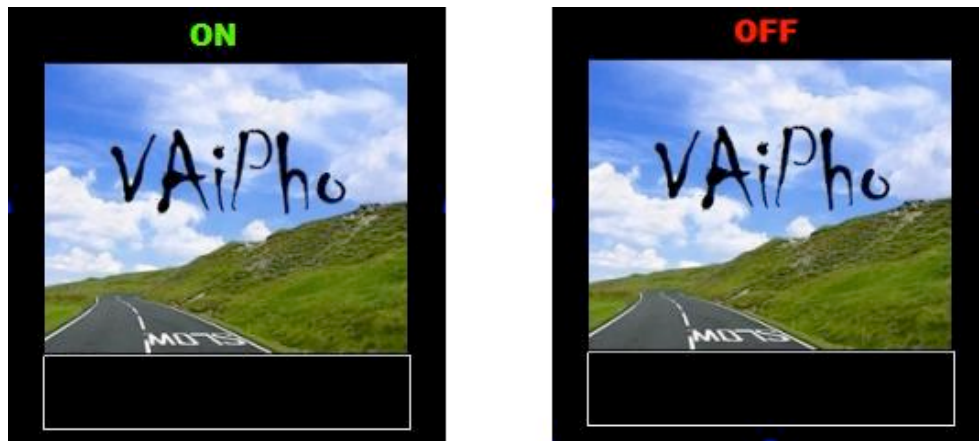
Figure 2. Visual aspect of VAIpho WatchDog

VAiPho User Interface: This interface allows the configuration of all VAIpho parameters and variables, as shown in Figure 3, as well as the use of the finder application. One of those variable parameters is the possibility that VAIpho turns off when the phone battery reaches a certain threshold, in order to preserve battery for the main function of the phone, which is to make or receive phone calls. This interface allows using VAIpho to know where the parked vehicle is. After pressing the button, the position where the parked vehicle is with respect to the user position appears on the map. Furthermore, this is the only interface that the user runs manually, since the other interface is automatically launched when the smartphone connects with the car's Bluetooth.