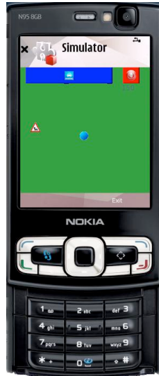
Figure 4. Visual aspect of VAIpho Automatic

Finally, Table 4 shows the power consumption involved in the use of different interfaces of VAIpho for Symbian. The worst case of battery life with different interfaces is there shown.