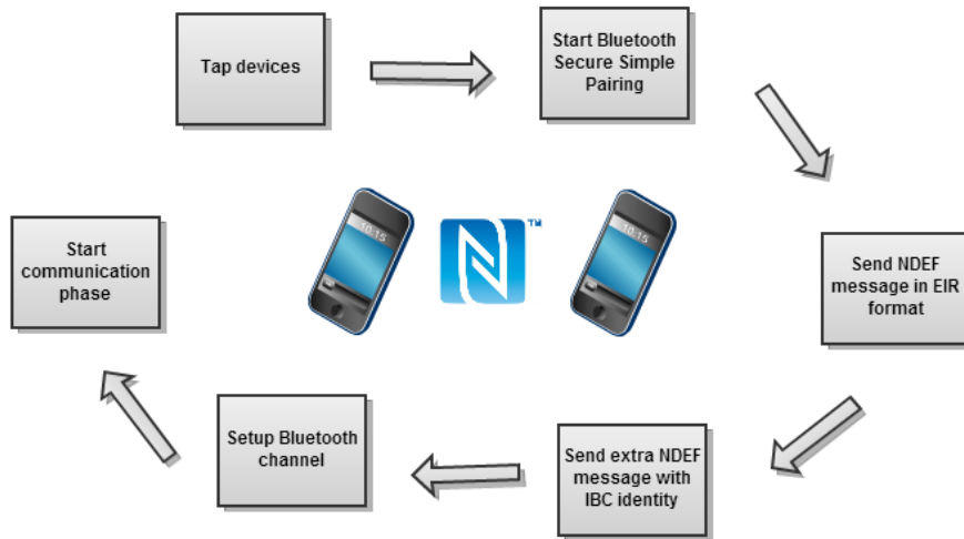
Fig. 1. Setup Phase