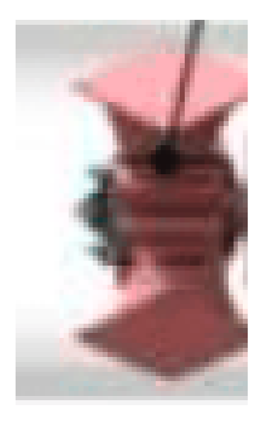
Fig. 2. Sectional View

ferential speed to its adjoining on the off chance that its two side pinion wheel work under various burdens. The movement got by the two side pinion wheels of the individual differentials is meant the three results. At the point when the two side pinion wheels of a differential get various paces, it makes an interpretation of the differential speed to a solitary result. The six differentials and work together to decipher movement from the information to the three results.