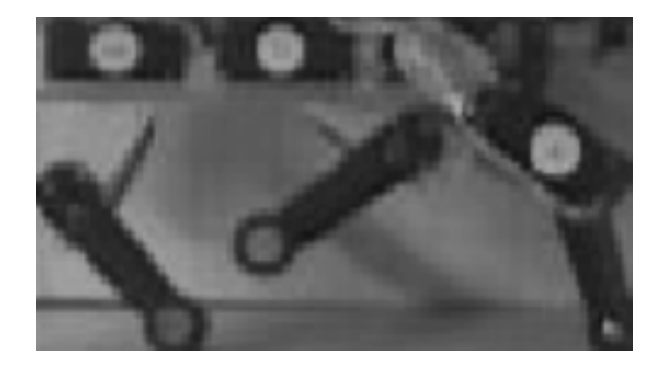
Fig. 1. Tracked Type Pipeline Inspection Robot

cribed to two components, the wall-clip system and the