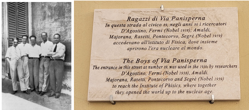
Figure 1. Picture of the ragazzi Panisperna taken from Wikipedia and my photo of the plate standing on the wall of the site.

Indices , co-authored with his former classmates, Luca Peliti and Marco D'Eramo, in which closed equations for the critical exponents of the \lambda -point of Bose liquids were found [5, 6]. In a sense, these papers appear as an initial interest in statistical physics problems. Other works of that time dealt with the conformal group, the two-dimensional conformal anomaly, and the nowadays reborn conformal bootstrap method to study phase transitions (see, e.g. [7]), which was proposed in the early 70s by Alexander Polyakov in the USSR, but also Raoul Gatto (another prominent figure in Italian theoretical physics who trained numerous “gattini”) and associates, independently [8, 9].