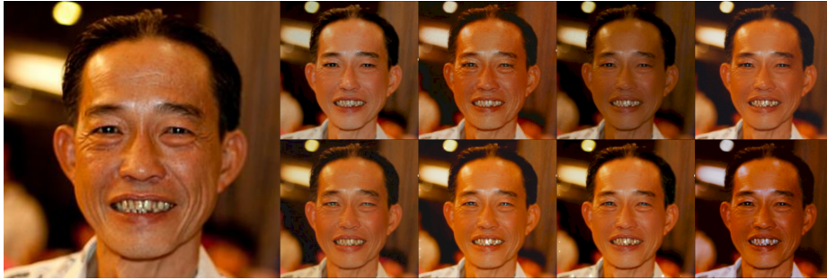
Fig. 1. Example of the eight different beauty filters applied to the left-most image from the FAIRFACE dataset [7].

individuals [19]. It has also been shown that the level of homogenization does not impact the performance of state-of-the-art face recognition models. In summary, these filters modify the faces so they conform to the same beauty standard while preserving the identity of the individuals [19].