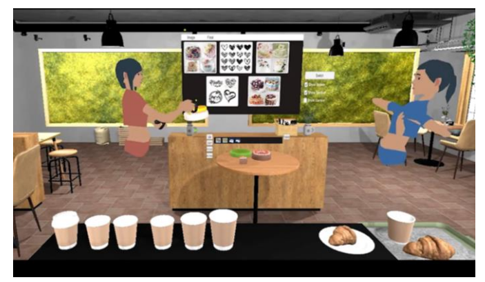
Figure 2. Social VR for co-design of cakes, as explored in [Mei21]

The work in [Mei21] adopted a Social VR platform to explore the appropriateness of this medium to solve co-design tasks, like allowing pastry chefs and clients to get together for proposing, refining, customizing and validating cake designs, and exploring them interactively in 3D from any viewpoint (Figure 2). Although limited to a pilot experience, both groups of participants were enthusiastic about the potential and flexibility of this medium for collaborative design and prototyping.