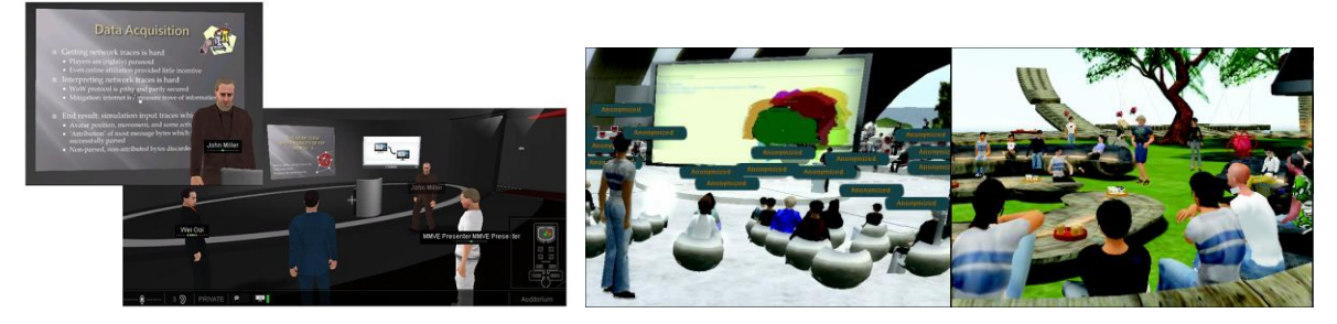
Figure 3. Social VR for virtual conferences: (left) event recreated in [Shi12]; (right) event recreated in [Eri12]

holding online conferences is not new. In 2010, the web.alive <sup>4</sup> tool from Avaya was adopted to allow mixed participation in the 3rd International Workshop on Massively Multiuser Virtual Environments (MMVE 2010) [Shi12] (see Figure 3, capture on the left). Remote participants highly valued the option to virtually participate in the event, especially due to their unavailability to attend in person. In 2011, researchers from IBM examined the potential of organizing an entirely virtual corporative conference in an avatar-based 3D virtual environment using Second Life<sup>5</sup> [Eri11] (see Figure 3, capture on the right). The conference was reasonably successful, although technical issues related to the platform set-up, performance and stability were quite frequent.