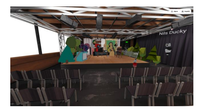
Figure 4. Virtual Visit to a Theater using Social VR, as explored in [Hag22]

The insights and conclusions from all these previous studies suggest that (Social) VR becomes a promising tool for different facets of (remote) education, including attendance at lectures and conferences, training activities and (interactive) exploration of spaces of interest.