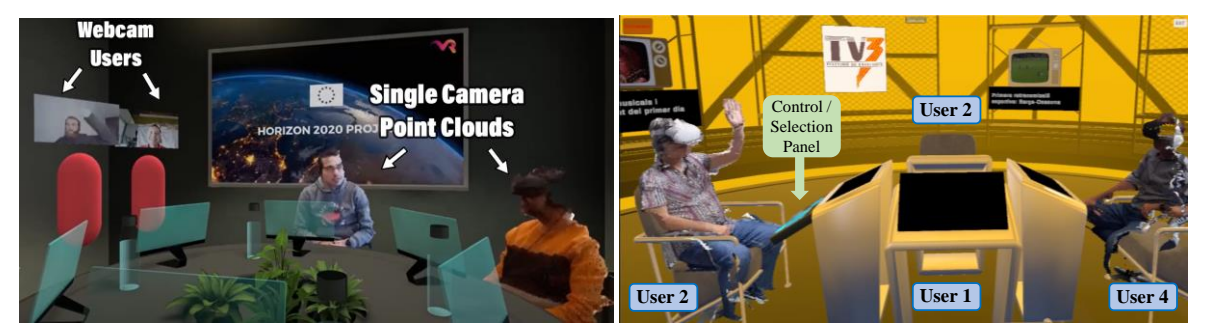
Figure 5. Examples of Social VR scenarios with holographic communications, as enabled in [Fer22a]

Thus, the studies reviewed in this subsection suggest that the benefits provided by Social VR platforms in the studies reviewed in the previous subsections may be augmented if realistic user representations can be provided, regardless of the target use case.