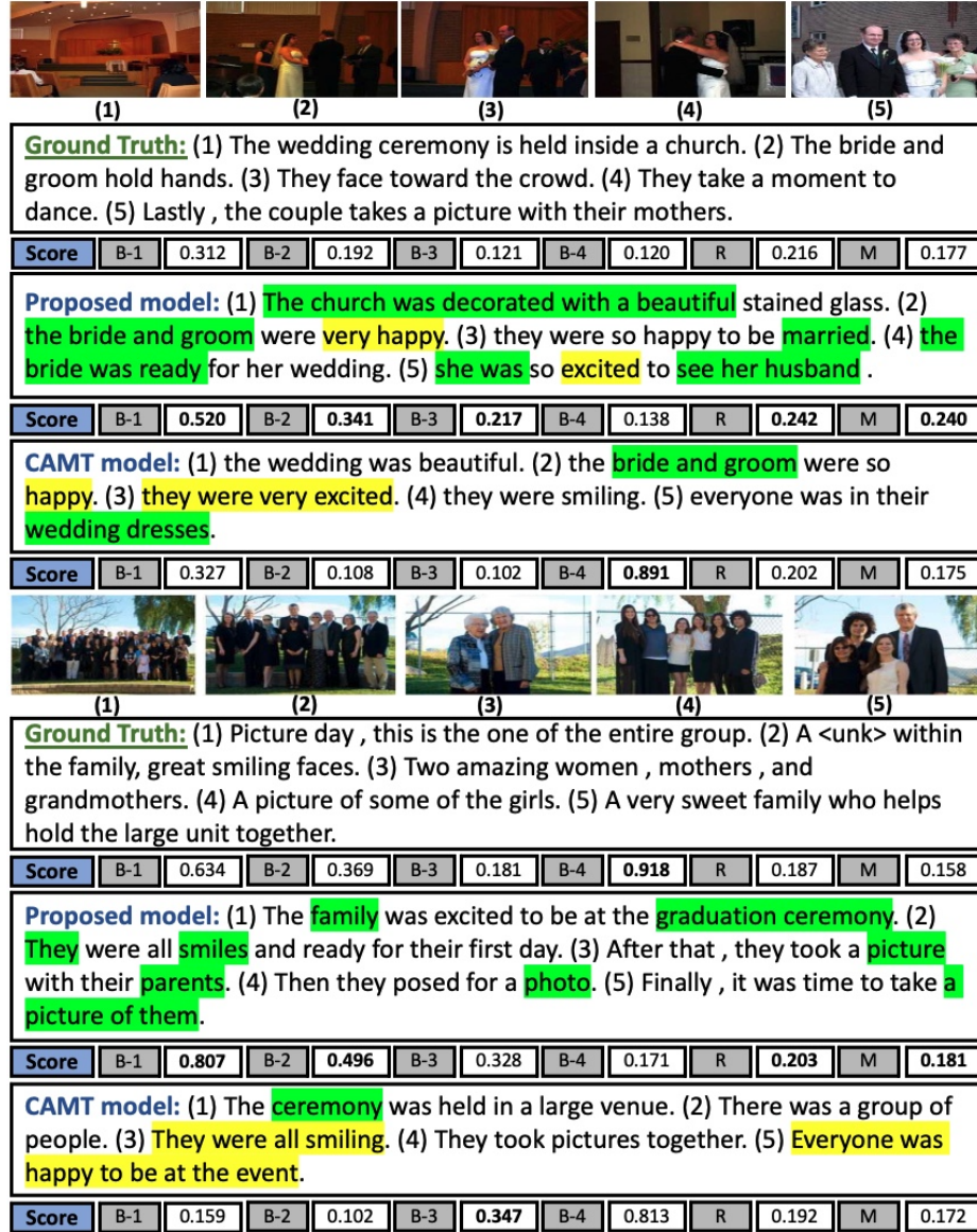
Fig. 3. Examples of our generated stories in comparison to the CAMT model [20] and ground truth. Text highlighted in green indicates high relevance to the image/story, while text highlighted in yellow means that it is not highly relevant but instead contains general information. BLEU-1 (B-1), BLEU-2 (B-2), BLEU-3 (B-3), BLEU-4 (B-4), ROUGE (R), and METEOR (M) scores are shown below each story, with bold scores indicating the highest value.