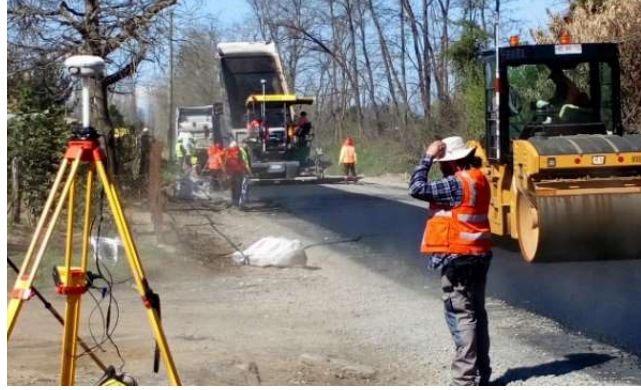
Fig. 1. Road construction workplace is a typical example of outdoor workplaces.

[12], while smart outdoor workplace (e.g., the road construction workplace as illustrated in Fig. 1) would emphasize real-time cooperation among various roles [48]. Furthermore, since outdoor workplaces are often linked with death and injuries to workers and members of the public, safety in smart outdoor workplace must be a crucial concern as stressed by Safe Work Australia [55].