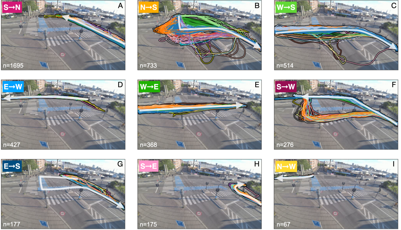
Figure 2: Traversal of the 12 source-destination (SD) pairs by the cyclists, which yields 12 SD-clusters of trajectories. White arrows denote the intended paths. Many trajectories deviate substantially from the intended paths. Colors within each SD-cluster depict different path clusters. For the three SD pairs N \rightarrow E , W \rightarrow N and E \rightarrow N there are not enough trajectories to detect an SD-cluster.

example due to occlusion by traffic signs or vehicles. After manual inspection we merged two pairs of SD-clusters that each had the same source and destination. We also discarded three other clusters of broken trajectories. In total this yielded 9 SD-clusters with 4432 trajectories, see Fig. 2, matching the 12 possible designed paths from Fig. 1 except for N \rightarrow E , W \rightarrow N , and E \rightarrow N where not enough trajectories were found.