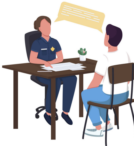
Fig. 1. The image visually picturizes the scenario in which an investigator is interrogating a suspect to uncover the truth.

impair the senses of the suspect to accept the truth, which eventually complicates your work. Think for a while if you can not forcefully retrieve the confessions, then what other options do you have to discover the truth?