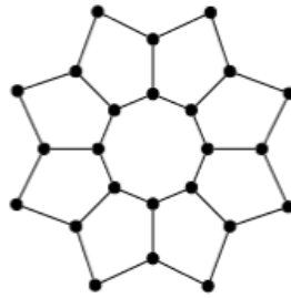
Fig. 3. Degree reduction gadget from Theorem 22 with d = 8 .