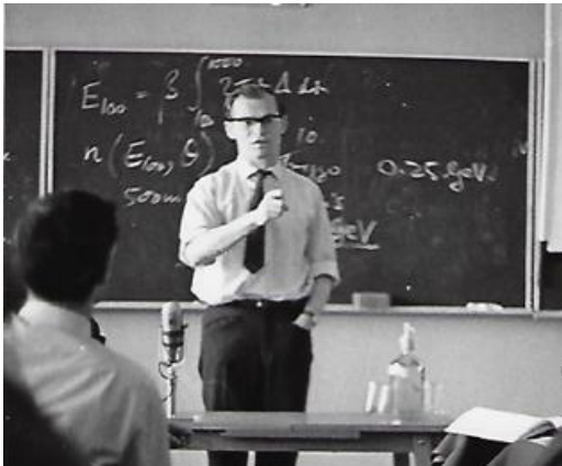
Figure 2: The author giving a talk about the water-Cherenkov detectors used at Haverah Park.

In 1966, Greisen, and Zatsepin and Kuzmin had pointed out that an implication of the existence of the cosmic microwave background radiation was that there would be a sharp fall in the flux of cosmic rays at energies above ~50 EeV. A few months before the Łódź meeting, the Haverah Park group had recorded an event for which the energy estimate was above this limit. I described this event, and details were published a few months later [5]. Re-reading this paper, with the benefit of over 50 years further experience in the field is rather embarrassing, as we made a number of assumptions that are now impossible to defend. But, it was an exciting time and the event was seen as important as this was the first such energetic particle detected since that reported by Linsley [6] five years earlier. The paper appeared in print only 24 days after submission<sup>2</sup>.