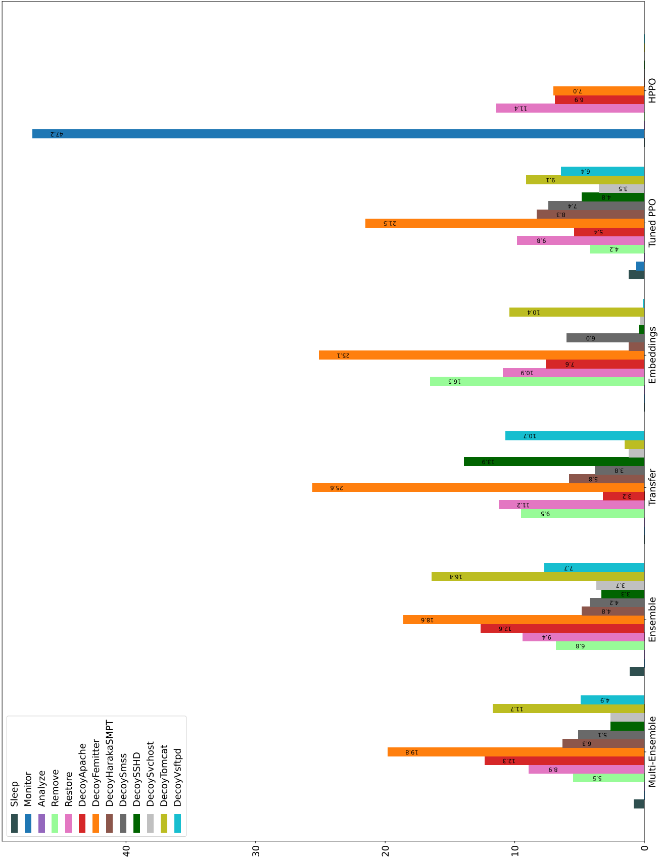
Figure 3: Bar chart showing the average number of actions per action type for each of the six models submitted to the CAGE Challenge. Numbers averaged over 500 episodes, combining results for both BLine and Meander at game length of 100.