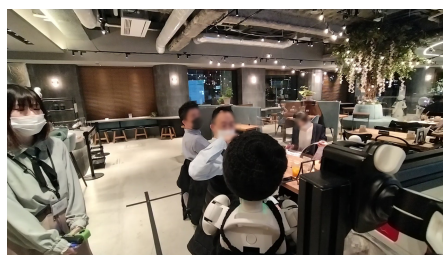
(b) experimental scene (cafe side)