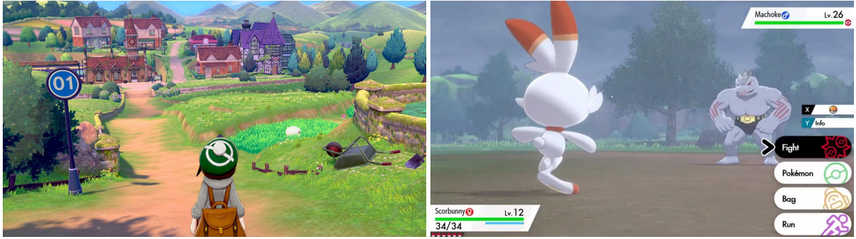
(a) A player is exploring the vast game world.