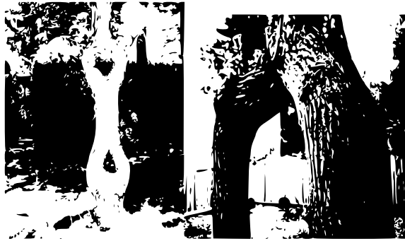
Figure 2. The organic quality of quantum haecceity.

The trees shown in Figure 2 have been deliberately coaxed into the forms shown, but trees in nature also naturally merge and separate given the appropriate conditions. The analogy with our current topic is that the saplings share identical essences but differing haecceities corresponding to their cardinality: specifically, there are N saplings. On the left, two saplings have been planted and coaxed into joining to form a collective entity of the same essence, with the potential to diverge and reunite again, which has occurred. Without the haecceities corresponding to their number, they would have no potential to converge and to diverge as shown, since there would be only a single entity.