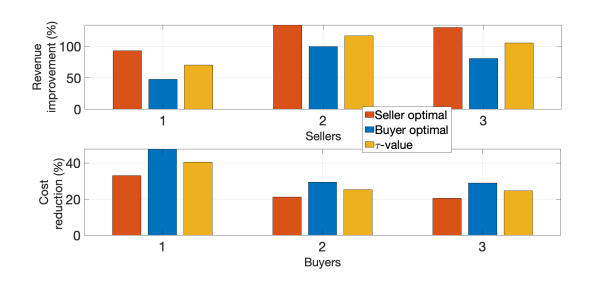
Fig. 3. Average revenue improvement (sellers) and average cost reduction (buyers) via seller optimal, buyer optimal and \tau -value payoffs compared to energy trading with the grid.

We have modelled P2P energy trading as an assignment game (coalitional game) and proposed a bilateral negotiation process as a clearing mechanism. The proposed P2P electricity market model encourages prosumers to participate by providing ease of accessibility, flexibility of choice and economic benefits, i.e., higher revenue (sellers) and lower energy costs (buyers) compared to trading with the grid. Furthermore, the bilateral negotiation mechanism enables participants to reach a trading contract ( \tau -value) which fairly divides the resulting market welfare among buyers and sellers.