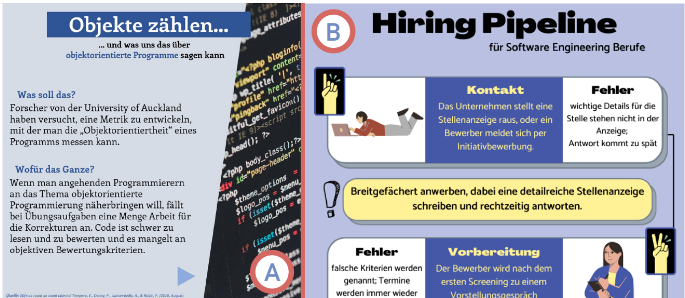
Fig. 2. Impressions on communication artifacts created by students in the seminar. (A) is one of a series of posts from an Instagram campaign to educate teachers about a new method for assessing the object-orientedness of computer programs. (B) is an excerpt from an infographic poster on tips and pitfalls in various steps of the hiring pipeline in the technology sector.