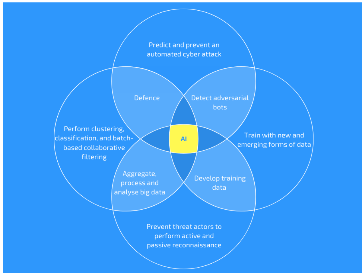
Figure 2: Alternative design of AI in cybersecurity