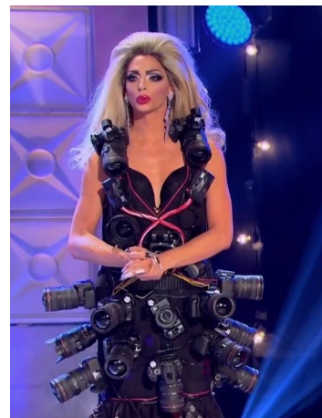
Figure 2: Photo of the Drag Queen discussed in Table 3

The conversation begins with the initial post "Anyone else loving Lil Nas X meming on biggots", referring to his tweet stating "i thought y'all didn't like political correctness. what happened?". This comment resulted in a high hatefulness prediction from comment-only Bert-HateXplain and a moderate prediction from the Graph methods. However, the hate predictions from the graph methods quickly neutralize as the conversation leads into a discussion of his latest song, Montero (depths 5 and 6). Given this context, it is clear to these methods that the conversation is not hateful but rather just discussing the lyrics of the song. However, this context is