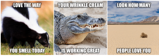
Figure 3: Examples of Multi-Modal Hate Speech

To examine the ability of graph and comment-only methods to capture inciteful speech, we analyzed two discussions from /r/conservatives and /r/politics, communities with polarizing user-bases (Waller and Anderson 2021). We found that graph methods are sensitive to counter-speech as evidence of inciting hateful discourse. This can be especially seen in Table 5, where users disagreeing on the cause of the Ukraine war lead to a high hatefulness prediction from the two graph methods. While there may be some validity to these predictions regarding their contentiousness, it does raise a concern about how to moderate these heated debates. However, in the case of the example in Table 4, the most inciteful comments (depth 2a, 2b, and 5) are appropriately labelled as such. In each of these cases, comment-only methods predicted each comment as neutral, even if the comments were hateful (depth 2b). We found that Graphormer was more sensitive to higher predictions than GAT when faced with these types of comments.