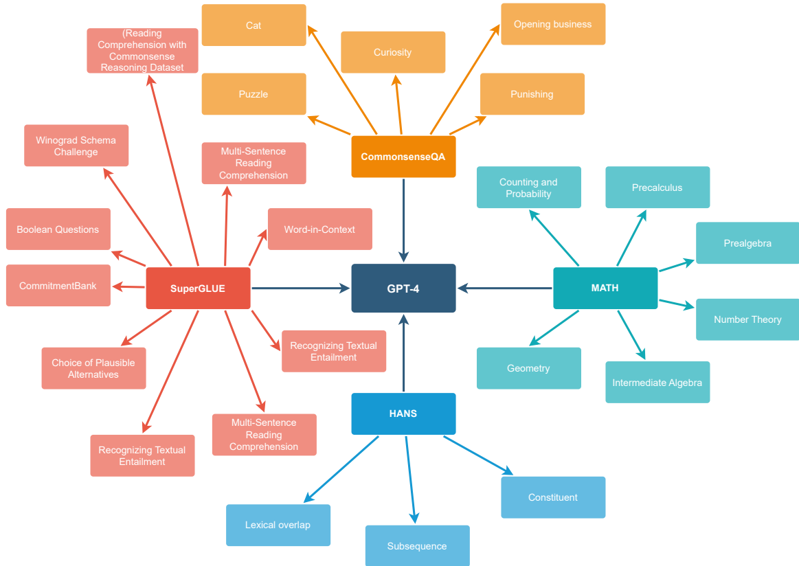
Figure 1: Datasets used in the study with the different categories contained in them.

that the BERT model performed below 10 % on the non-entailment category. The human performance on MATH varied from 40-90 % and GPT-2/GPT-3 showed accuracies below 10 %.