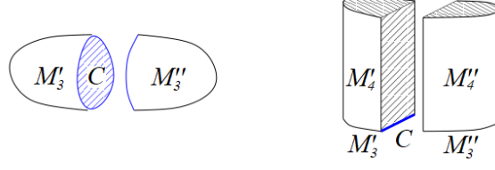
FIGURE 1. Left: M_3 as a connected sum of three-manifolds M'_3 and M''_3 along a common Riemann surface C . Right: M_4 split along four-manifolds M'_4 and M''_4 with corners.

In summary, from (3.6) and (3.7), we can write