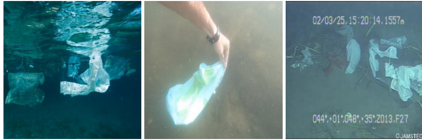
Fig. 2. Representative images from proposed dataset.

The first step to create this dataset is to collect inputs from various open-source datasets and videos with varying ocean environments from different countries. We manually annotated the marine debris in frames of images, focusing on selecting images with difficult object detection conditions such as occlusion, noise, and illumination. The annotations were done using a free annotation tool [25], resulting in 9,625 images in the dataset. A few of the sample images from our dataset are shown in Fig. 2. It can be seen that the diversity of objects and the environments that were considered in this paper.