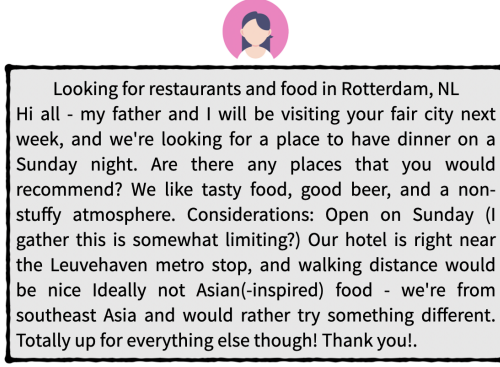
Fig. 1. An example narrative query soliciting point of interest recommendations. The query describes the users preferences and the context of their request.