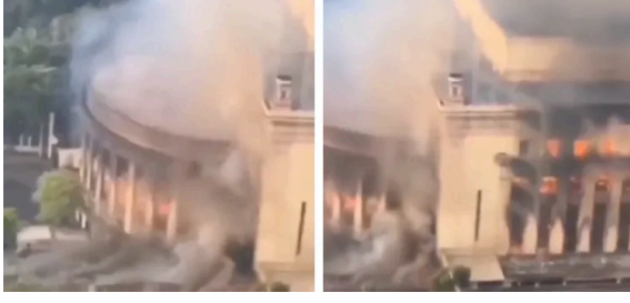
Figure 1: A fact-checked claim with multi-modal components 7

it was stated that the video shared on social media shows the moments when protesters in France set fire to the Alcazar Library in Marseille during the recent protests. The reviewer who gathered supporting information noted that ‘According to inverse visual search results, the video is not from Marseille; it’s from the Philippines. The building that caught fire is the Manila Central Post Office.’ As a result, in order to verify such claims every aspect of evidences should be processed. Since our focus in this study is linguistic aspects of fact-checking, we do not make use of claims that require multimodal processing.