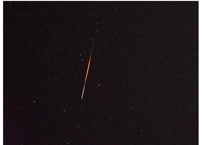
Figure 1 – The brightest Tau Her meteor detected by us on the 31st of May 2022. We estimated its brightness to be -2 magnitudes as it passed through Corvus.

This year, we present a continuation of our efforts, expanding upon the initial findings and offering a more comprehensive analysis of the Tau Herculis. Our observations have yielded a population index of r = 5.56 \pm 1.83 , a figure that stands out when compared to other published values. This discrepancy, we hypothesize, could be attributed to the heightened sensitivity of our observational equipment, particularly adept at detecting fainter meteors. Furthermore, we have refined our measurements of the radiant position of the meteor shower for the mid-time of our observations.