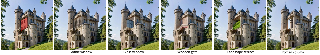
Fig. 1: Through the integration of the powerful editing capabilities of diffusion models and user-drawn masks, we have achieved precise editing of architectural facades. This innovative approach opens up new possibilities in the field of architectural design, allowing designers to customize the appearance of buildings more intuitively and efficiently. In this editing process, users first provide textual descriptions of the architectural facade editing effects they wish to achieve. Subsequently, users specify the editing areas by drawing masks, such as for windows, doors, walls, etc.

Abstract —This paper explores the utilization of diffusion models and textual guidance for achieving localized editing of building facades, addressing the escalating demand for sophisticated editing methodologies in architectural design and urban planning. Leveraging the robust generative capabilities of diffusion models, this study presents a promising avenue for realistically synthesizing and modifying architectural facades. Through iterative diffusion and text descriptions, these models adeptly capture both the intricate global and local structures inherent in architectural facades, thus effectively navigating the complexity of such designs. Additionally, the paper examines the expansive potential of diffusion models in various facets, including the generation of novel facade designs, the enhancement of existing facades, and the realization of personalized customization. Despite their promise, diffusion models encounter obstacles such as computational resource constraints and data imbalances. To address these challenges, the study introduces the innovative Blended Latent Diffusion method for architectural facade editing, accompanied by a comprehensive visual analysis of its viability and efficacy. Through these endeavors, we aim to propel forward the field of architectural facade editing, contributing to its advancement and practical application.