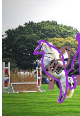
(b) Cropped with 0% Threshold