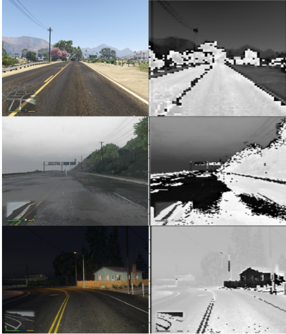
Fig. 2: Input images and feature maps of the second convolutional layer in PilotNet

only in the section of the road directly ahead of the vehicle. This is due to the illumination provided by the vehicle's headlights, which illuminate that portion of the road, while the surrounding areas remain dark. Such lighting conditions can present challenges, resulting in daytime driving being more accurate than nighttime driving.