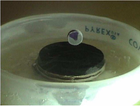
FIG. 1: Photograph of experimental setup. A YBCO disk rests on a metal base that is submerged in liquid N_2 . A Nd_2Fe_{14}B magnet levitates on top of the superconductor.

The observed effect is surprising because there is no obvious source for the kinetic energy of rotation that the magnet acquires, or for the torque that makes the magnet spin overcoming air friction. The effect does not depend on details of the experimental setup described above. We have observed it also with other superconducting samples of different shape, even with several small pieces of superconductor supporting the levitating magnet. The effect