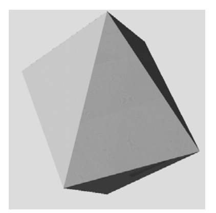
Fig.1: The level surface of the capital requirement associated with the specific risk of a portfolio consisting of three bonds. The weights have been absorbed into the positions. Note that here, and also in the subsequent figures, the risk polyhedra are shown so as to make clear their convexity properties, disregarding their actual position in the coordinate system.

The "iso-risk" surface A = const. is a closed polyhedron (in 3 dimensions an octahedron, shown in Fig.1) which can easily be seen to be convex for any \gamma_i \ge 0 and any number of dimensions (number of different items) n .