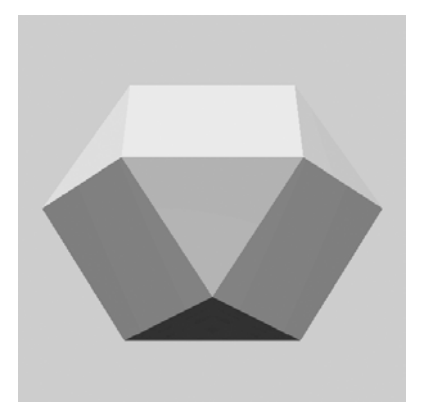
Fig.2: The iso-risk surface of a three component FX portfolio.