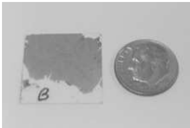
FIG. 1. Large relatively uniform films can be deposited on substrates of arbitrary composition. Shown is a redeposited nanotube film on a microscope coverslide.

nologies Inc and additionally purified based on a procedure derived from Chiang et al. [18]. Nanotubes, held in an alumina crucible, were allowed to react in moist air (obtained by bubbling ambient air through an immersed frit in room temperature water) at 225 degree Celsius for 18h (using a tubular oven; flow = 0.1 L/min). The remaining solid was suspended in concentrated HCl (37%, ACS grade Aldrich) and immersed in an ultrasound bath for 30 min. The nanotubes were then filtered, rinsed, and washed with water until a neutral pH was reached and then dried in a vacuum oven.